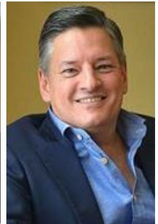
Ted Sarandos Chief Content Officer

22. Not surprisingly, given the lack of diversity (including particularly racial diversity) in key leadership positions within Netflix, not one Netflix executive is listed on Black Enterprise’s “300 Most Powerful Executives in Corporate America” even though Netflix is considered an innovative industry leader currently listed as 197 on the Fortune 500.