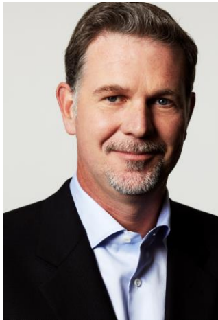
Reed Hastings Founder/CEO

1 2 3 4 5 6 7 8 9 10 11 12 13 14 15 16 17 18 19 20 21 22 23 24 25 26 27 28