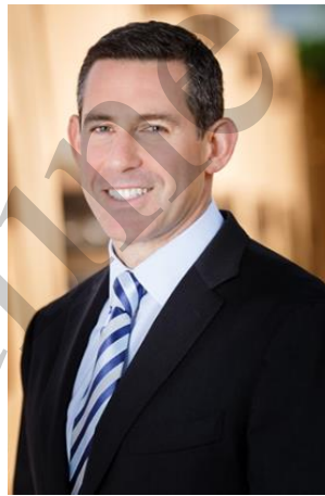
Spencer Neumann Chief Financial Officer